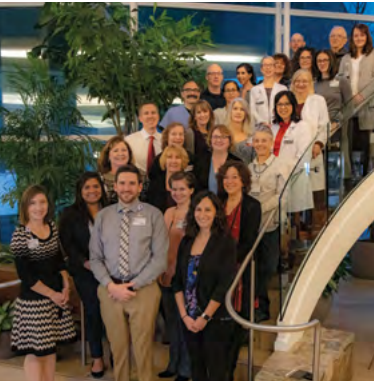
THANK YOU TO OUR DEDICATED CANCER COMMITTEE MEMBERS.